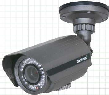
CB700VFIR960 / CB700VFIR5960